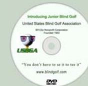
Junior Program DVD

Our Coaching DVD and Junior Program DVD is now available. When ordering your copy, please make a small contribution of $5 or more to cover the shipping and handling cost.